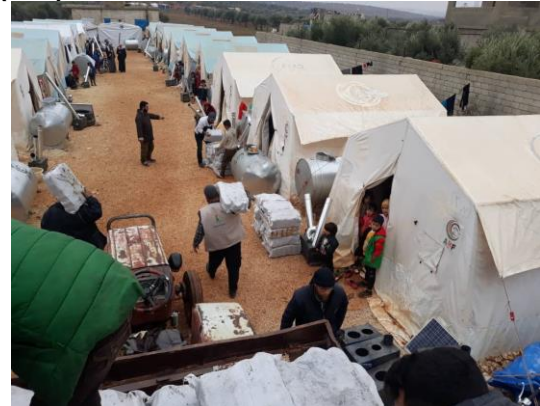
Above: Recent pictures of displaced Syrian children and families sleeping under trees. Below: Pictures of previous projects building camps in Syria. The need for such camps is very high.